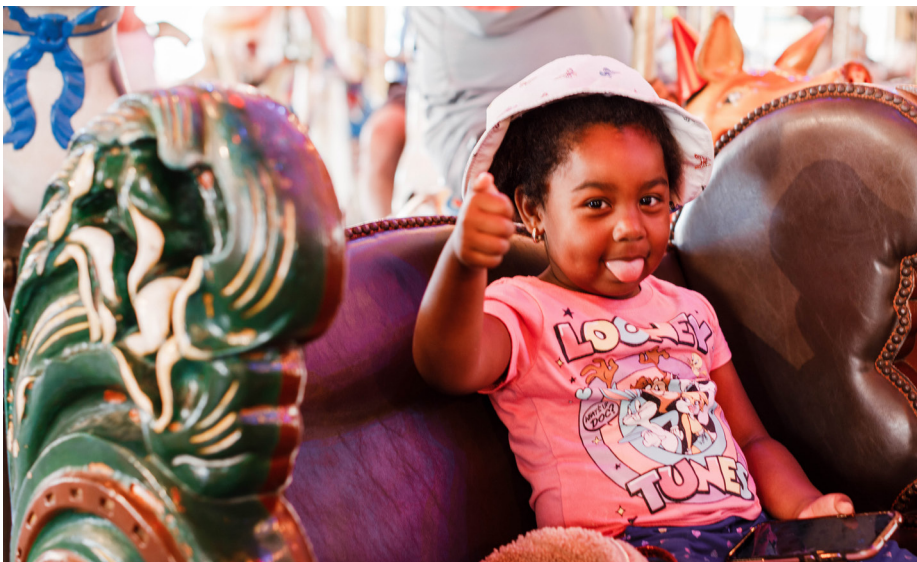
National Carousel Day is just around the corner. Celebrate the day at the Dorothea Laub Balboa Park Carousel on July 25, 11AM-5:30PM. Free rides and activities for all. Follow @BalboaParkCarousel for updates.

Please visit BalboaParkCarousel.org for updates on the reopening date and the Carousel's summer schedule.