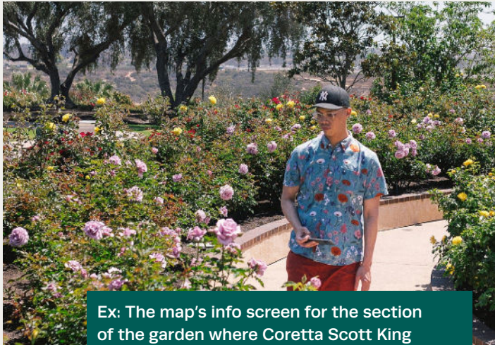
The Rose Garden map project was made possible by the San Diego Foundation Rose Garden Fund.

Ex: The map’s info screen for the section of the garden where Coretta Scott King roses are found (C4) describes the variety as “creamy pink blossoms with coral edges [that] celebrate civil rights activist Coretta Scott King, the wife of Martin Luther King, Jr.” It then lists additional details, including the year the rose was introduced (2013).