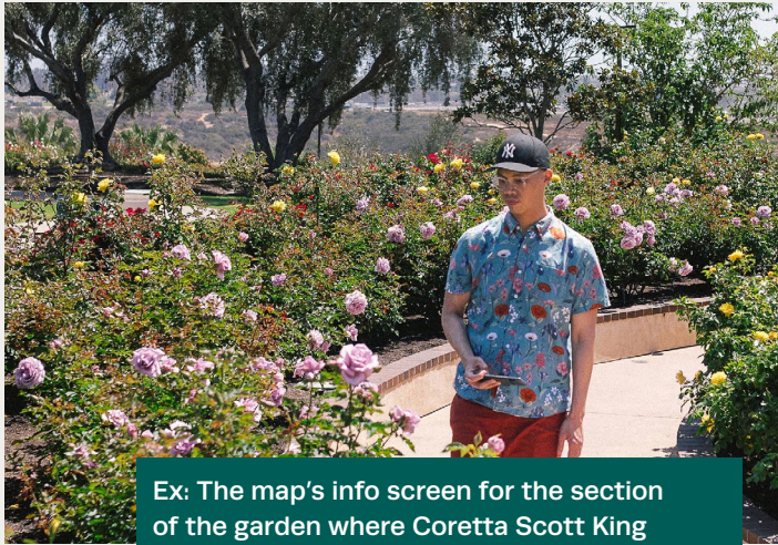
The Rose Garden map project was made possible by the San Diego Foundation Rose Garden Fund.

Ex: The map’s info screen for the section of the garden where Coretta Scott King roses are found (C4) describes the variety as “creamy pink blossoms with coral edges [that] celebrate civil rights activist Coretta Scott King, the wife of Martin Luther King, Jr.” It then lists additional details, including the year the rose was introduced (2013).